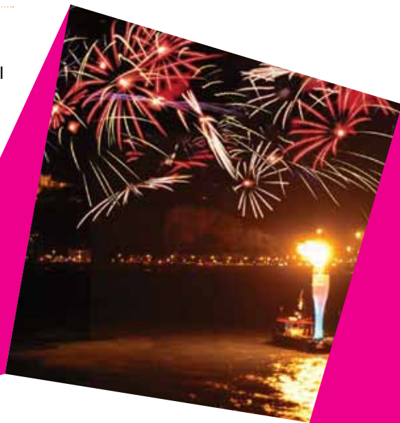
Image: Light Up Dover – The World Famous