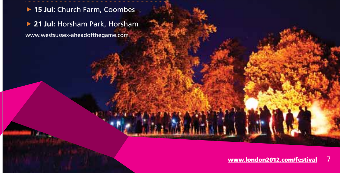
Image: Whispering Woods