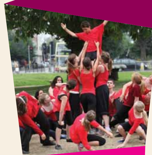
Photo above: Big Dance in the South East Photo right: Big Dance

www.southeastdance.org.uk www.bigdance2012.com A London 2012 Festival event