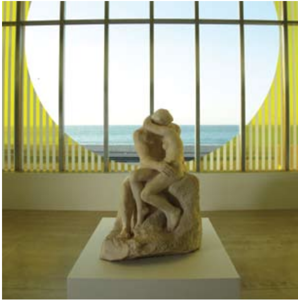
Auguste Rodin, The Kiss , 1901–4. Tate, London 2011 (installation view at Turner Contemporary).