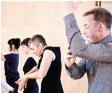
Siobhan Davies, Songbook by Matteo Fargion, for ROTOR 2010