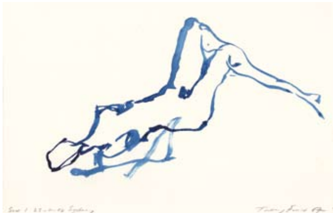
Tracey Emin, Sex 1 25-11-07 Sydney

Tracey Emin's first major solo exhibition at Turner Contemporary is conceived specially for Margate, where Emin grew up and which has provided inspiration for many of her most famous art works. The exhibition explores the themes of love, sensuality and romanticism in Emin's oeuvre, featuring both new and existing works including drawings, monoprints, sculptures and neons.